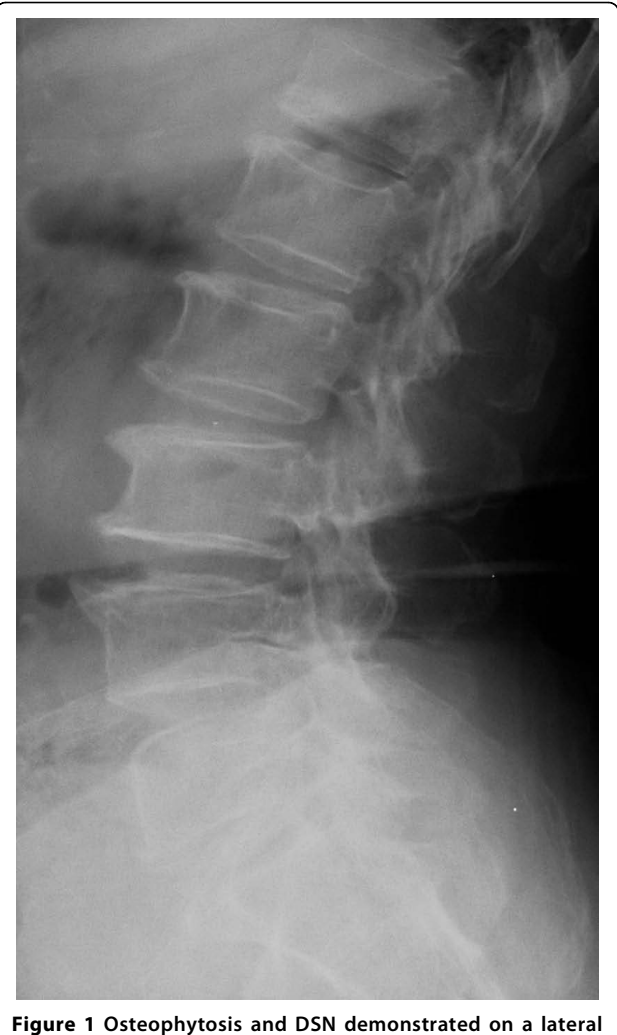
Figure 1 Osteophytosis and DSN demonstrated on a late lumbar spine X-ray.