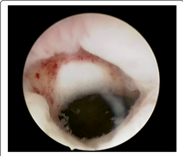
Fig. 2 Hysteroscopic appearance of a cesarean scar defect

according to the established clinical pathways. Assessments about the improvement of CSD related symptoms (menstrual duration, menstrual volume, abdominal pain, and irregular bleeding) were mainly performed by a hospital visit. When follow-up assessments were not reported in the clinic medical records, telephone interviews were conducted by an obstetrician with at least 5 years of experience (Telephone interviews guide, see Additional file 1). The timing of surgery was defined as the interval between the first day of menstruation when blood starts to come out of the vagina and surgical treatment date.