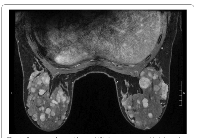
Fig. 2 Contrast enhanced breast MRI shows innumerable bilateral breast masses ranging from 0.5 to 5 cm in size

Although solitary fibroadenomas are very common and benign, the presence of multiple, bilateral fibroadenomas in a young patient should raise suspicion for alternative pathology, which can be assessed with genetic testing. Although this is a single case report, this is the first report of genetic testing in this rare presentation of fibroadenomas. Identification of a PTEN mutation allowed for appropriate cancer screening and risk reducing measures for this patient. Further studies are needed to evaluate the utility and cost-effectiveness of