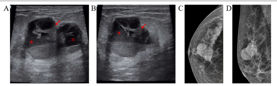
Fig. 1 a, b Ultrasonogram revealed no echogenic (red *) and well circumscribed mass with solid striped septum (red ∠), weak echogenic deposition in the dorsal side. c, d On the CC and MLO mammograms showed lobulated mass without calcification

Chen et al. BMC Women's Health (2021) 21:284 Page 2 of 4