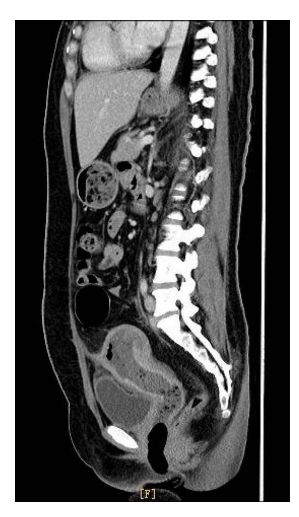
Fig. 1 Sagittal computed tomography images. The uterus shows heterogeneous spongiform enlargement with multiple air locules, measuring 4×2.6 cm and extending over 5 cm. We have observed a difficulty in distinguishing between the myometrium and the endometrial cavity

extending approximately 5 cm from the cervical opening. The tissue appeared white and emitted a foul odor. It was recommended to undergo a laparoscopic surgery.